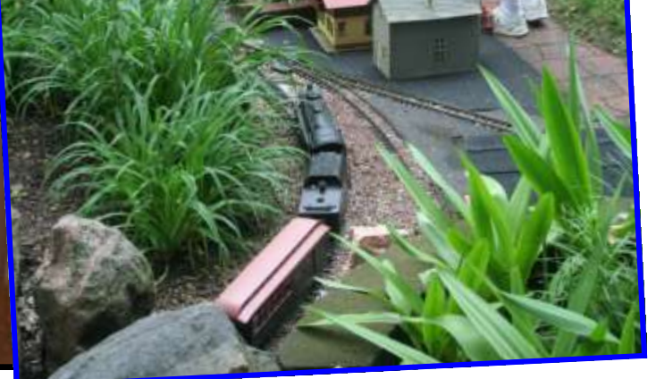
PIKO Camelback Loco from Reindeer Pass