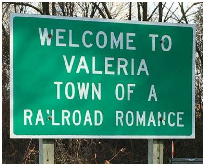
Intriguing sign discovered in Central Iowa while meandering home one day.

Lunch will start around noon and will be followed by our traditional meeting at 2:00.