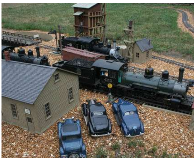
Double Header Pulling into station

The motion to adjourn was made and the meeting ended just in time to play with trains.