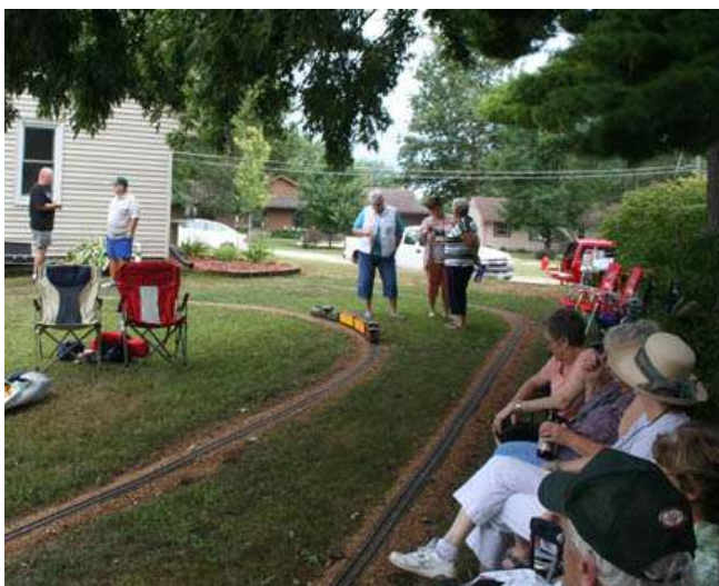
The gang is lining up to watch trains run and the CIGRS August Train Meeting is about to start!

We hope to see you soon at a meeting place near you.