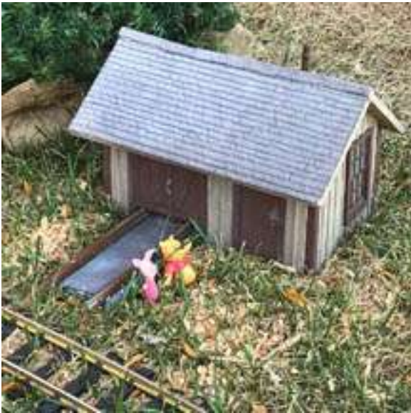
Pooh & Piglet visiting the Island of Sodor!