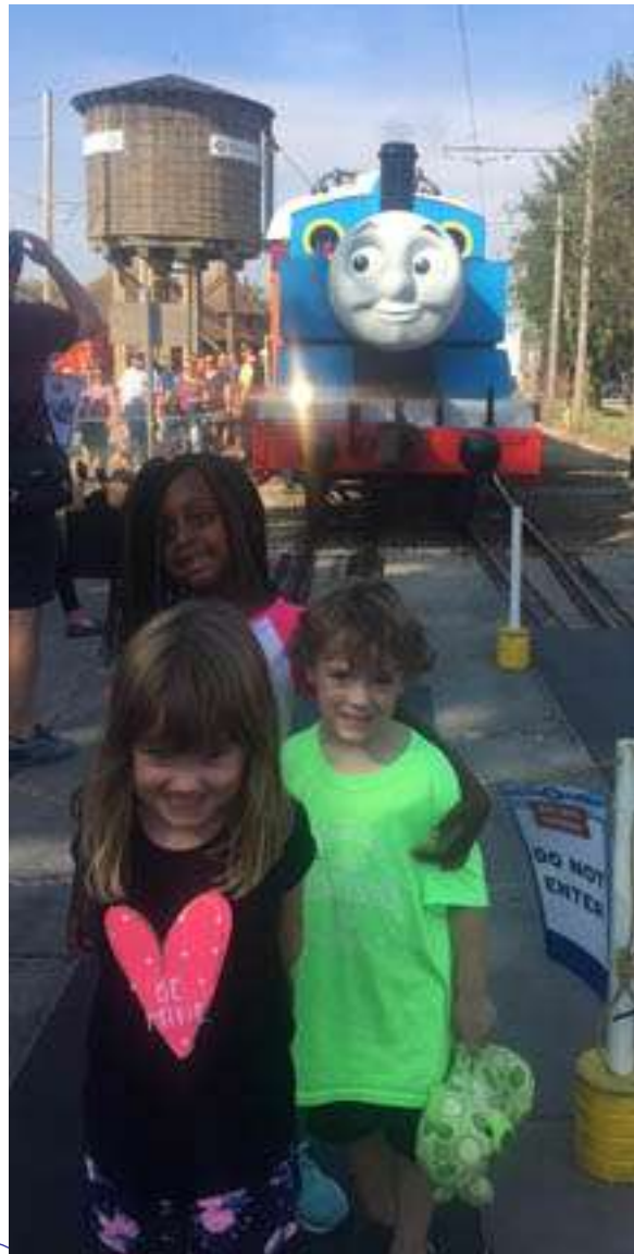
More fans of Thomas with the real McCoy.