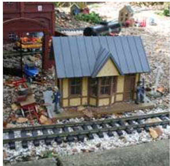
Right: Down by the station, early in the morning!

Editors Correction For those of you who caught that last month's August edition was mis-marked September congrats ! That and $1.25 will get you a cup-o-coffee.