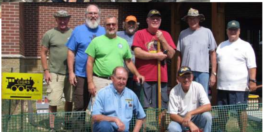
The CIGRS build out and tear down crews