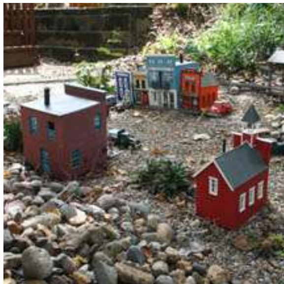
Left: Nice little town you got there!