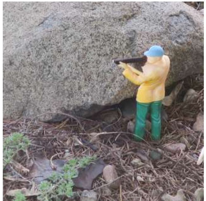
Deats' re-enactment of the movie Bambi...