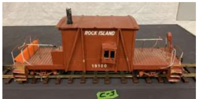
Rock Island MoW Bay Window Transfer Caboose - Gene