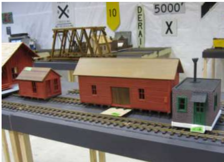
Other buildings entered by Karla. Stacking the deck!

Congrats to all the winners. See Photos.