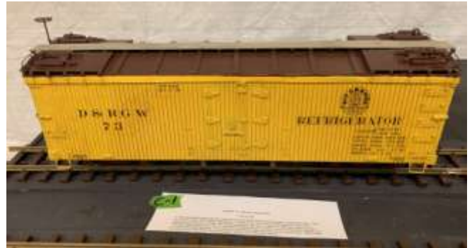
D&RGW Woodside Reefer Car - Howard Hoy