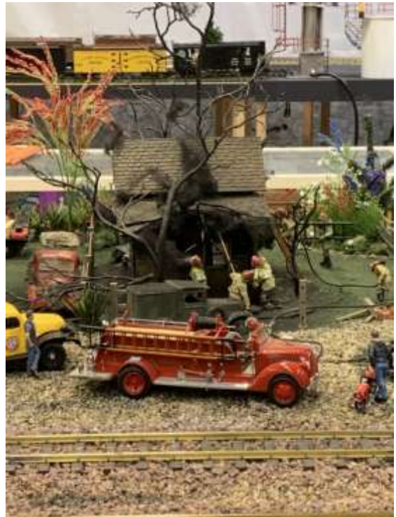
Gosh I hope nobody got hurt!