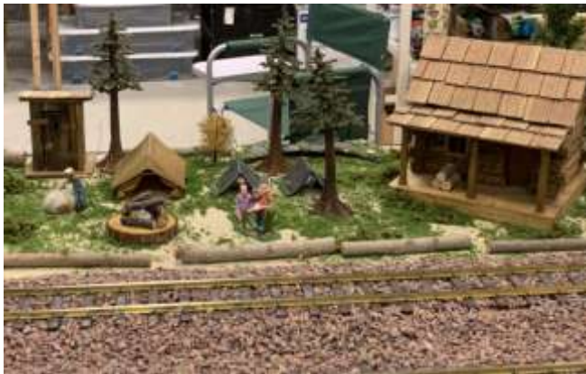
Little early to be camping ain't it? Thank goodness the outhouse isn't a double decker though.