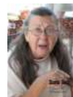
Sharon Seely Need Actual Birth Date Only have Circa, and need Photo of Layout (8X10) Better Personal Photo is pending.