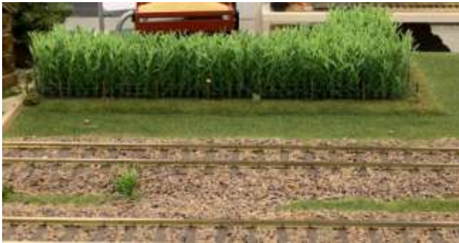
It must be July, that corn looks like it is as tall as an elephants eye!

Looking good gents!