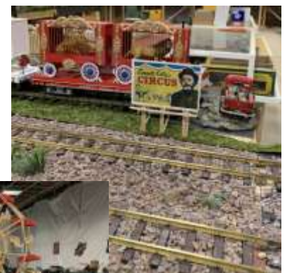
Circus is in town, and there's that elephant!