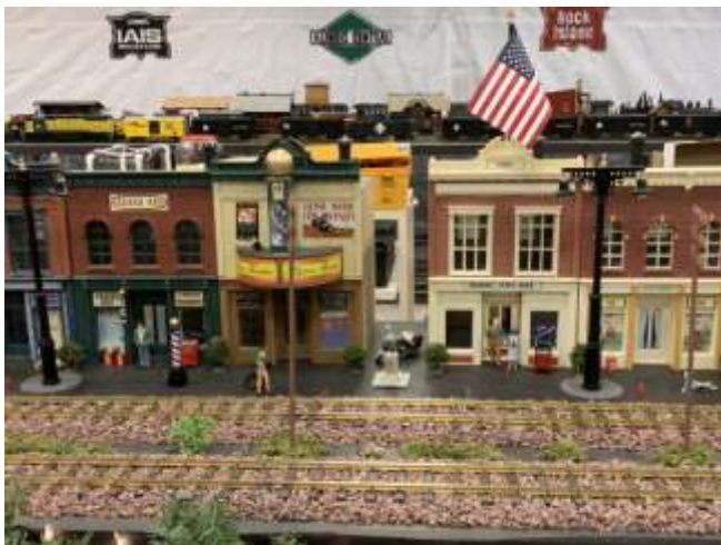
Main Street USA CIGRS style!